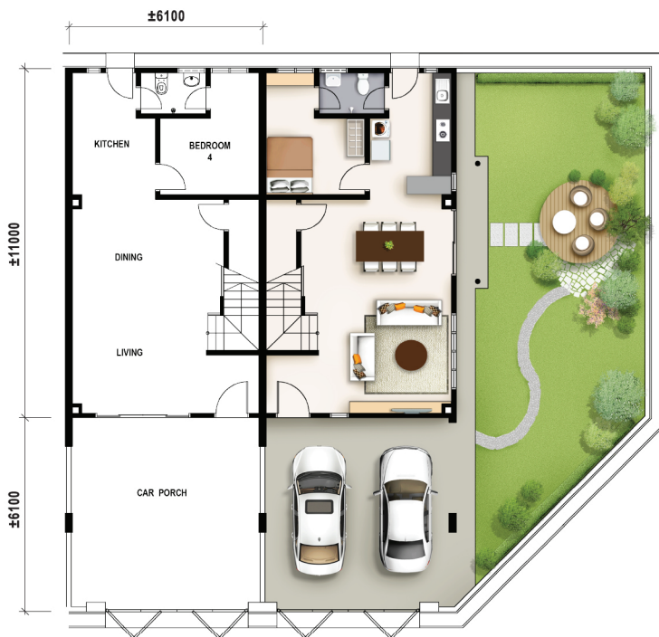
Ground Floor Plan Double Storey Terrace - Type B