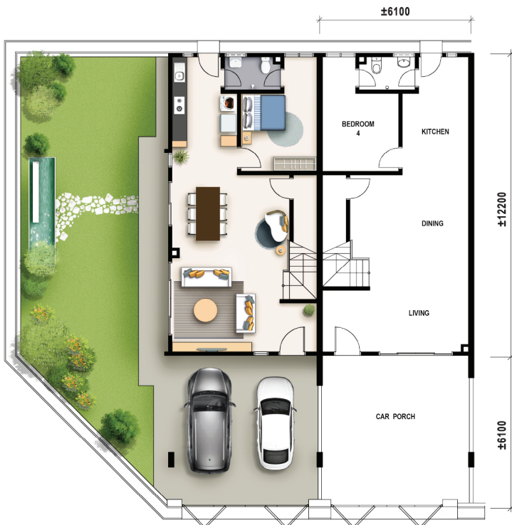
Ground Floor Plan Double Storey Terrace - Type A