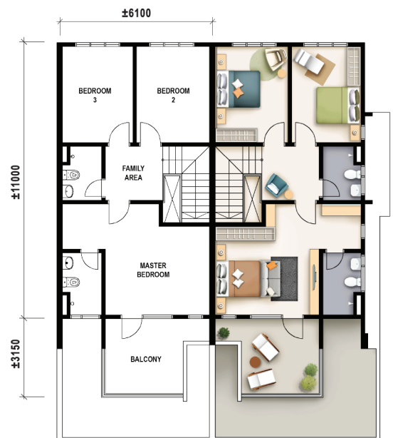
1st Floor Plan Double Storey Terrace - Type B